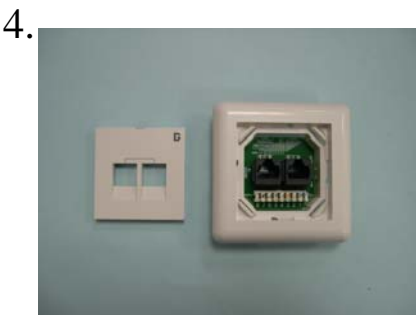
Flush mount wall plate contain housing, module & central small plate.