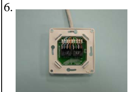
Follow the direction on the color coding to position T568B or T568A wiring, separate a little space on proper position and insert the 4 pair wires into the slot, then keep the twist as near IDC as possible.