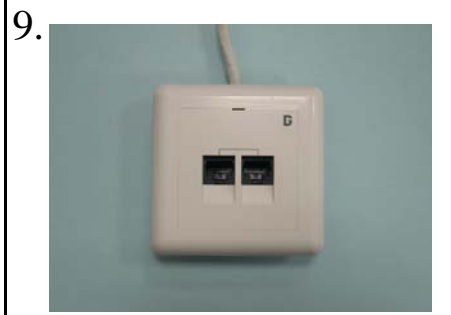
Push down central cover.