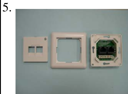
Separate frame from base housing.