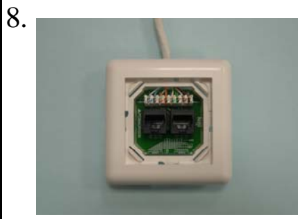
Put frame on base housing again.