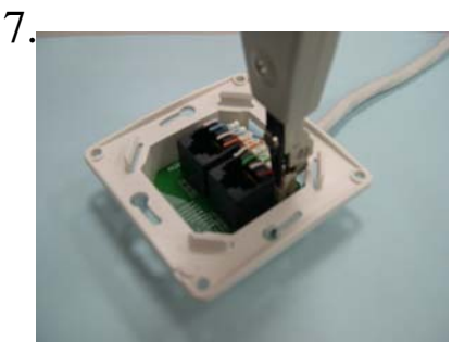
Use a punch down tool to complete the termination and cut off any access wire.