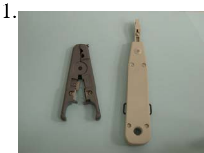
Stripper, Punch down tool.