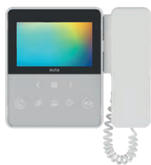
NEOS HANDS FREE + HANDSET